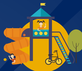
My Family Care