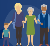
Family & Caring Matters Network