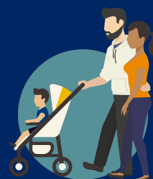
Shared Parental Leave

We are proud of the inclusive policies we have in place to make things better and support everyone to be their unique self at work.